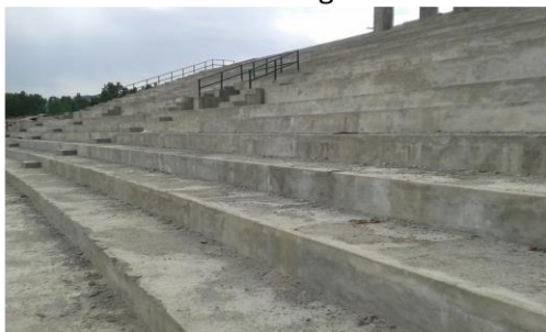
Steps of football stadium