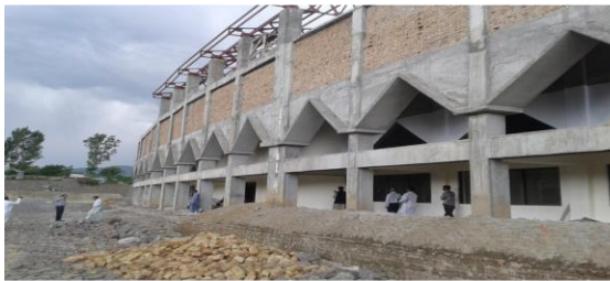
Arches of the football stadium