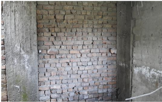
Poor quality of brick masonry