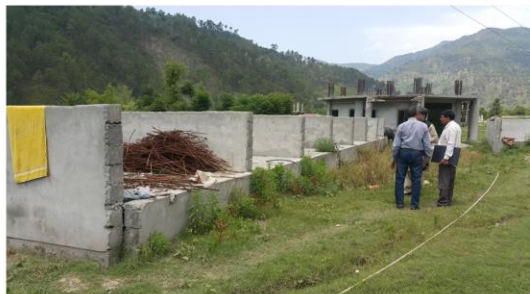
Rusted steel stored in Under construction Fiber glass sheds