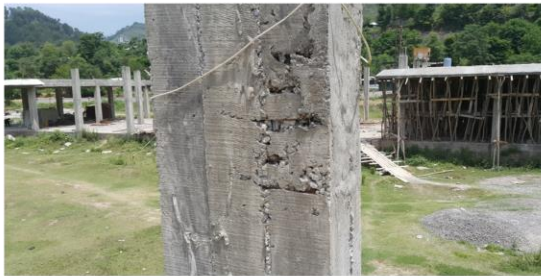
Steel reinforcement exposed due to less concrete cover