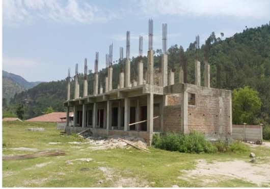
Under construction shop building