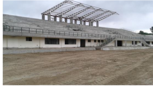
Shed sheets required to be installed on steel trusses