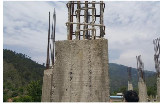
Non-uniform spacing in steel reinforcement observed