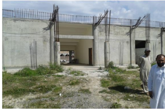
Disputed land of VIP Hockey Pavillion