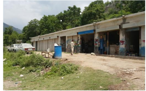
Private shops facing toward the vegetable market