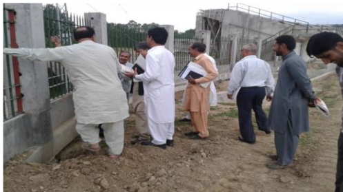
Fence of stadium being checked