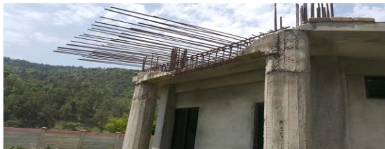
Poor quality of concrete finish along with massive honey combing observed in structural work of mosque