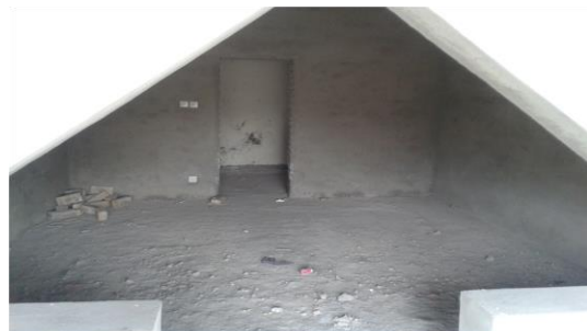
Inappropriate size and location of door in office