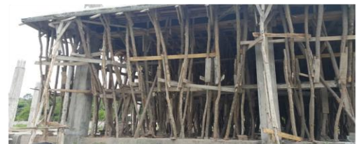
Wooden formwork used