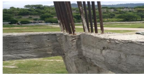
Non-uniform spacing in steel reinforcement and poor concrete finish