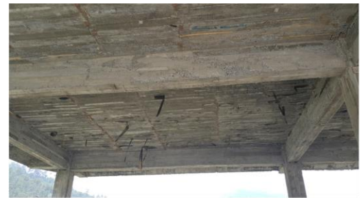
massive Honey combing observed in roof of under construction Auction area shed