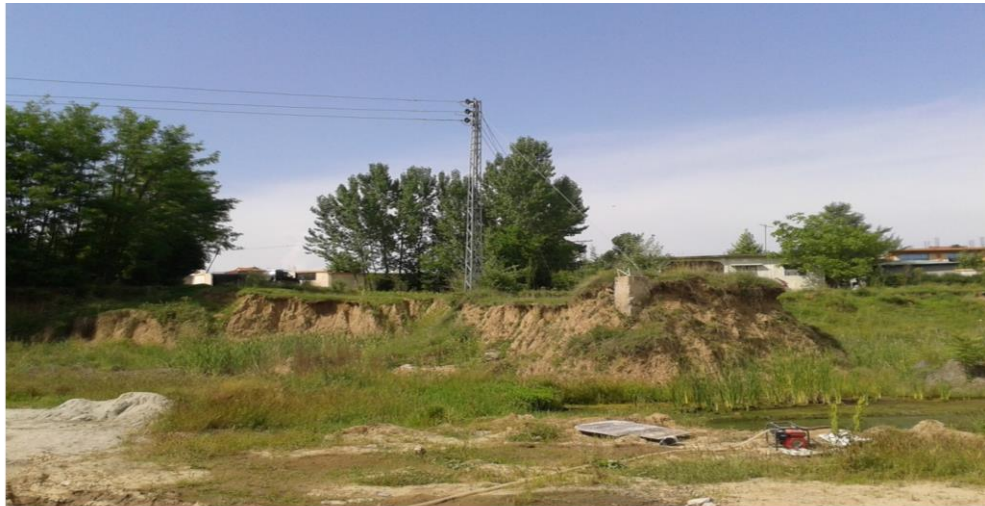
Electric Pole required to be shifted to facilitate the construction of Parking and approach road