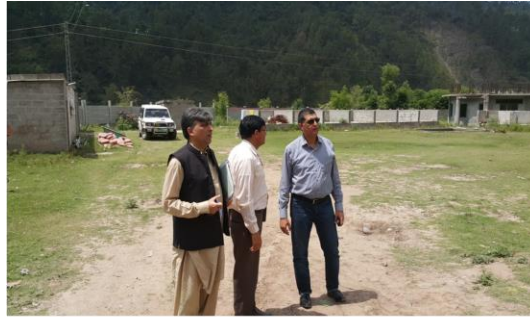
Sec. P&DD being briefed about the project