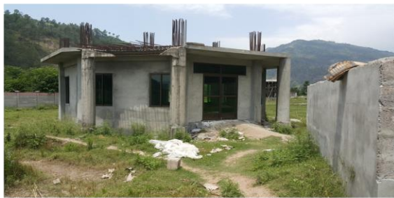
Under construction Mosque