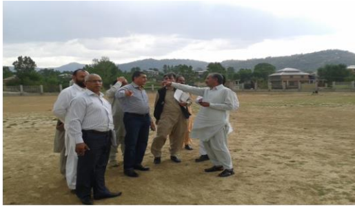
View of the Football ground