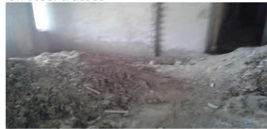
Bathrooms under construction