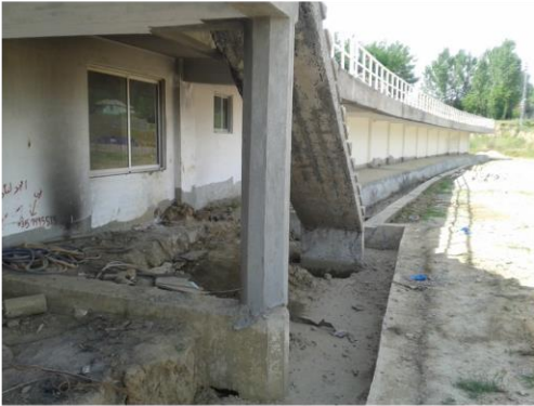
Footpath and drain incomplete