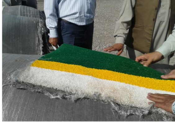
Synthetic trough being Laid