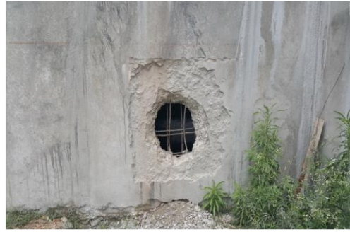
Cutting of RCC Wall being done