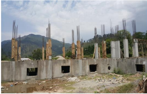
Commission Agents Shops