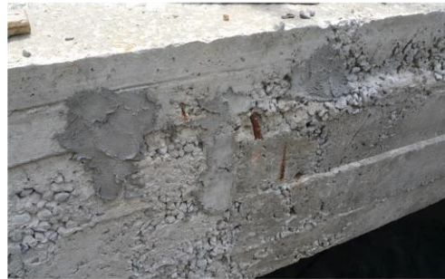
honey combing and steel exposed due to less cover