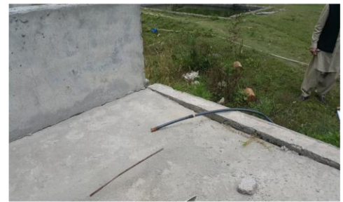
Settlement observed in floors of fiber glass shed shops